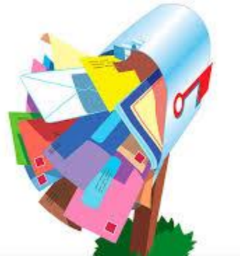
Faith Letters to Jesus: